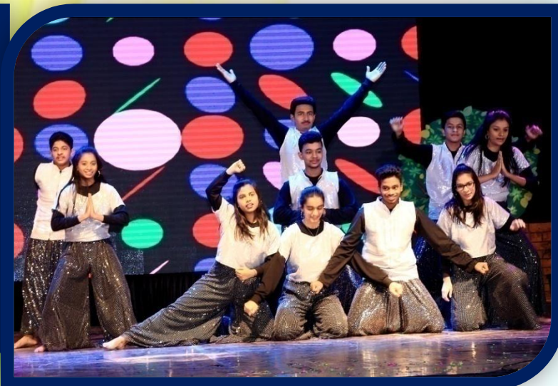
Dance – Finnale