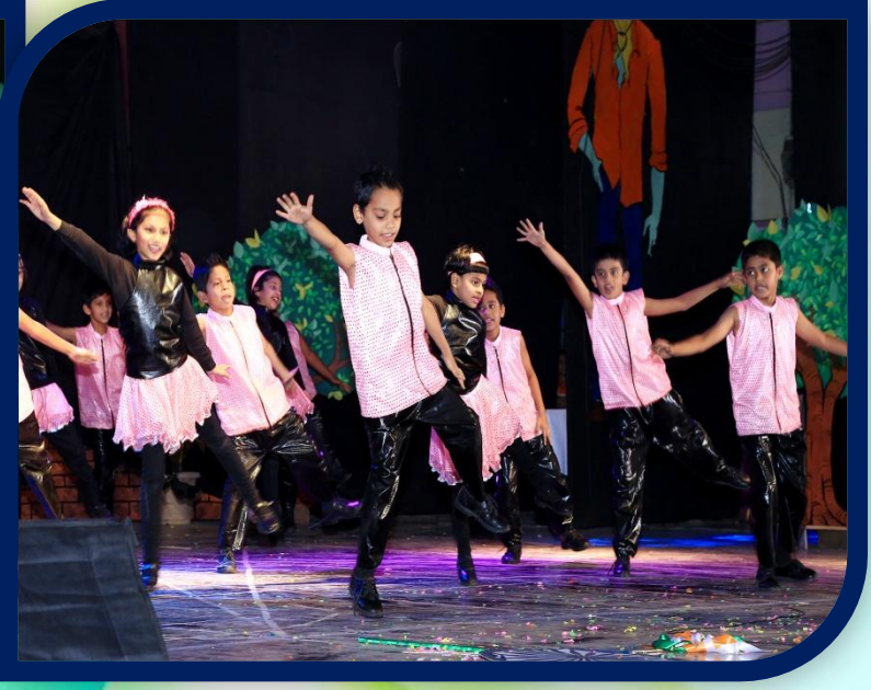
Dance - Chatte Batte