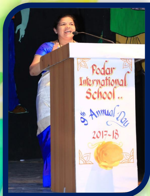
Speech by Chief Guest