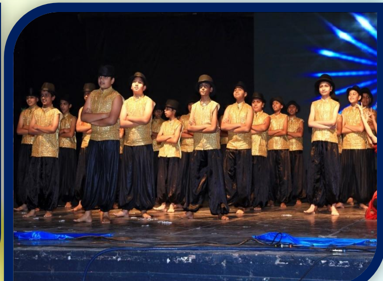
Dance – Kathak & Western Fusion