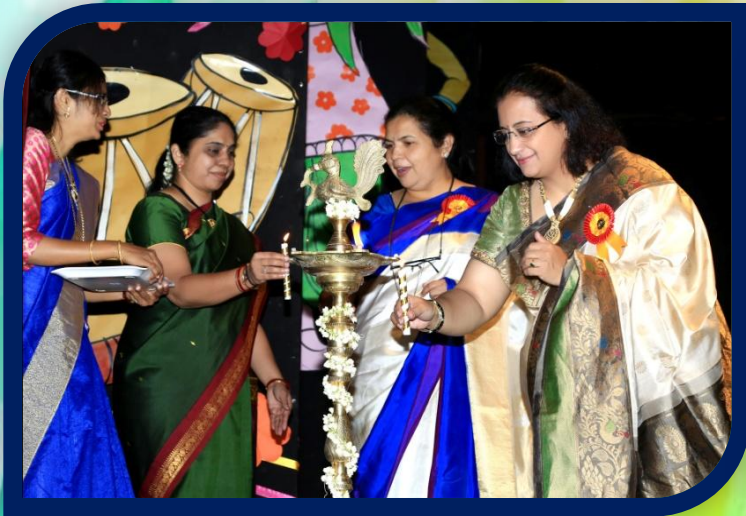
Lighting of Lamp