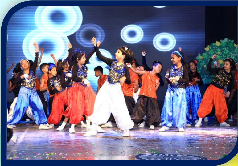
Dance - Andhi