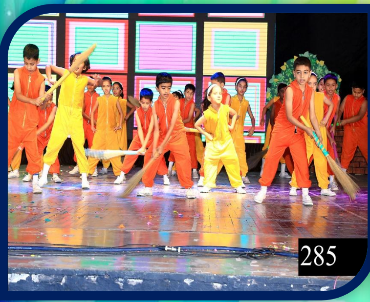
Dance - Cleanliness