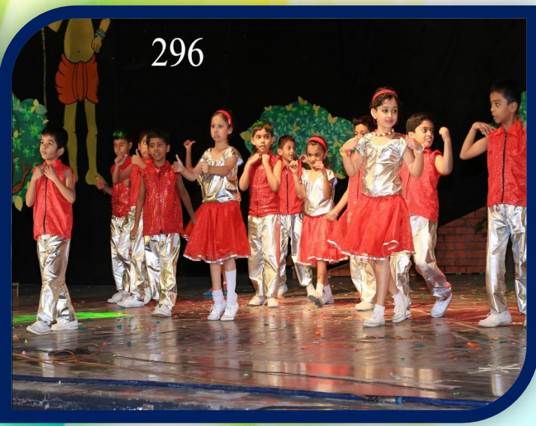
Dance - Chatte Batte