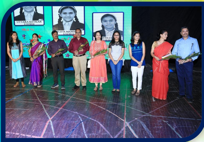
Felicitating of Std X Board Toppers