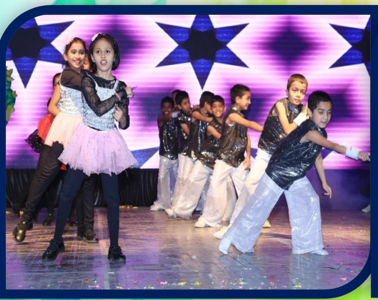
Dance - Sikandar