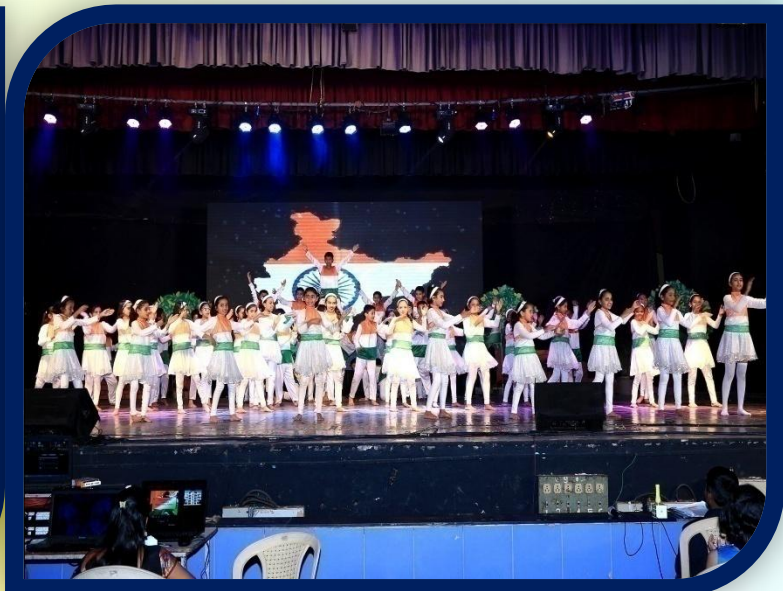
Dance – Jai ho