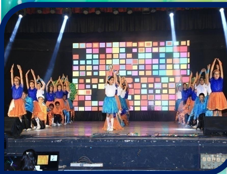
Dance - Pathshala