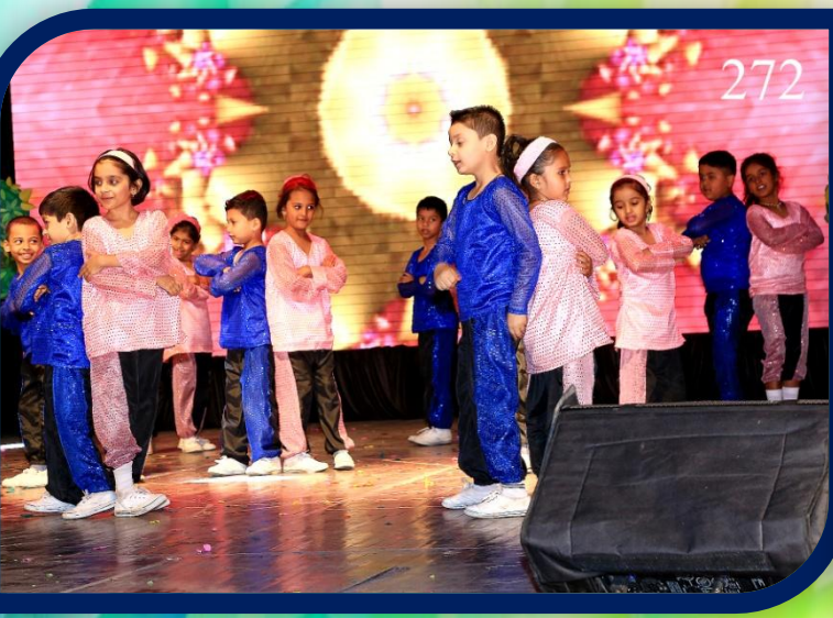
Dance - Sikandar