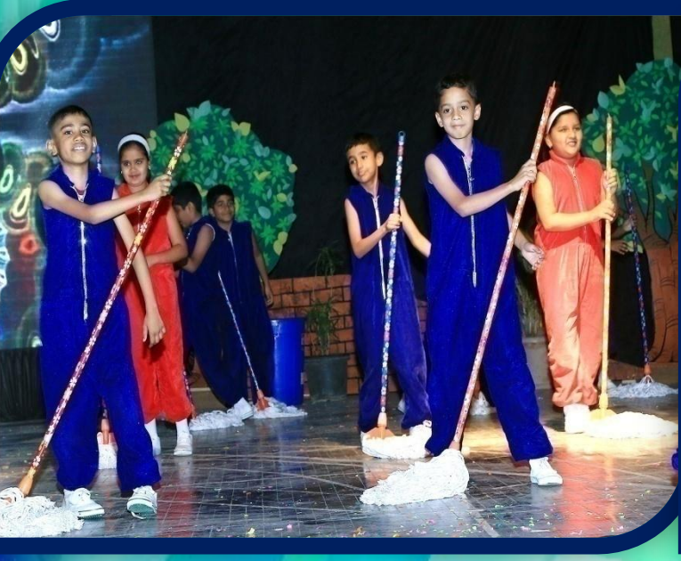
Dance - Cleanliness