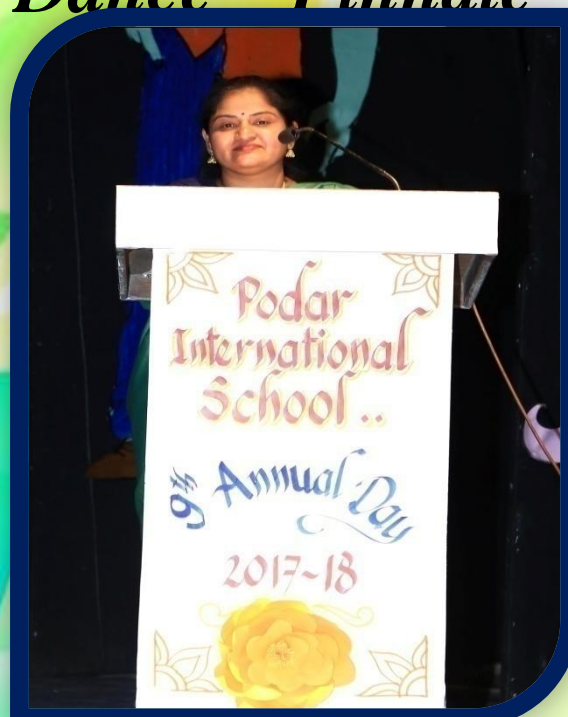
Vote of thanks