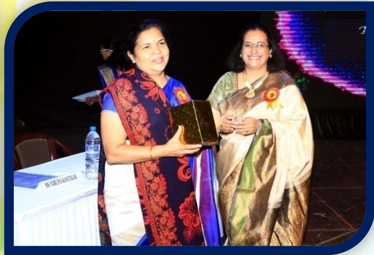
Felicitation of Chief Guest